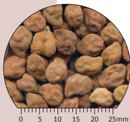
Genesis ™ 509